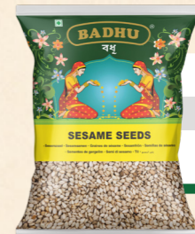
Sesame Seeds Packaging 10 x 80g