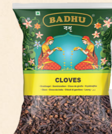
Clove Whole Packaging 10 x 60g 6 x 200g