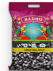
5 kg Pouch