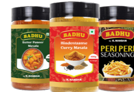
100 gm Bottle