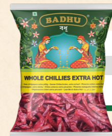
Chillies Whole Extra Hot Packaging 10 x 30g