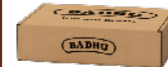
100 gm Bottle (12 bottles)