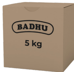
5 kg Pouches (3 in a box)