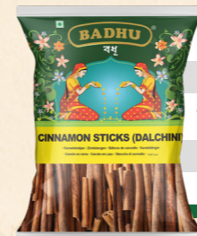
Cinnamon Sticks Packaging 10 x 35g 6 x 150g 8 x 400g