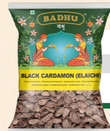
Black Cardamom Packaging 10 x 50g