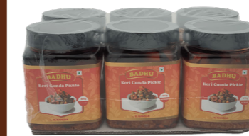
200 gm Pickle Bottle (6 bottles)