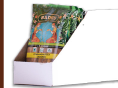
100 gm Pouches (10 in a box)