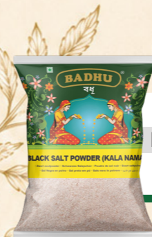
Black Salt Packaging 10 x 100g