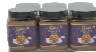
200 gm Masala Bottle (6 bottles)