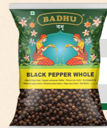
Black Pepper whole Packaging 10 x 60g 6 x 300g