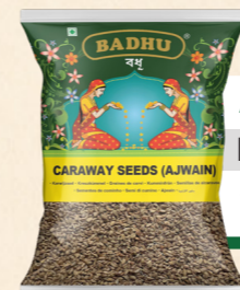
Ajwain Packaging 10 x 100g