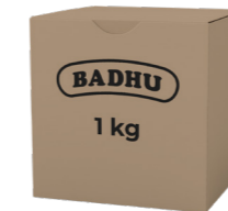
1 kg Pouches (8 in a box)