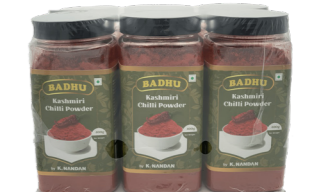
400 gm Masala Bottle (6 bottles)