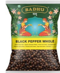
100 gm Pouch