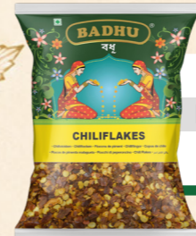
Crushed Chilies Packaging 10 x 80g