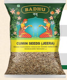
Cumin Whole Packaging 10 x 100g 6 x 300g