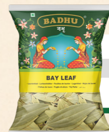
Bay Leaves Packaging 10 x 15g