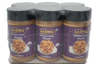
100 gm Bottle (6 bottles)