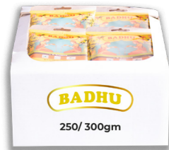
250/300gm Pouches (10 in a box)