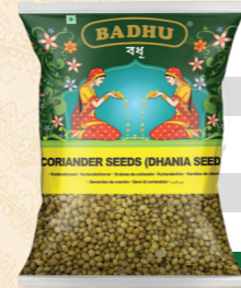
Coriander Whole Packaging 10 x 60g 6 x 200g 8 x 500g